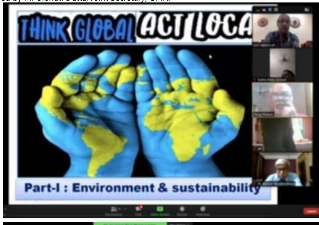
Screen shot of the virtual meeting