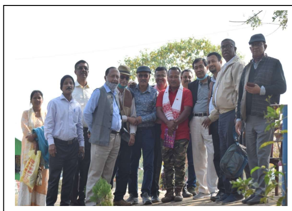
GMA Team on Industrial Visit to Elephant Friendly Echo Tourist Resort, Indo Bhutan Border