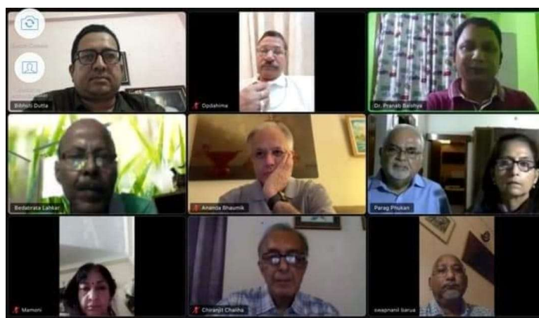
Screen shot of the virtual meeting