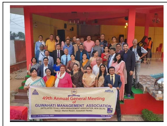
( Cross section of GMA members in the AGM )