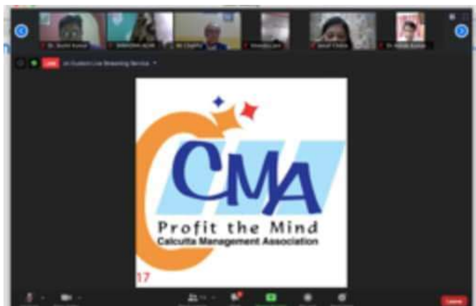
Screen shot of the webinar